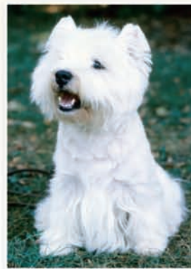
West Highland White Terrier

Responsible breeders strive to breed healthy dogs with the appropriate temperament for their breeds. The purebred dog breeder should be a resource for the life of your dog, someone you can go to for advice about raising your dog and someone with whom you can share and exchange information and treasured stories about your dogs.