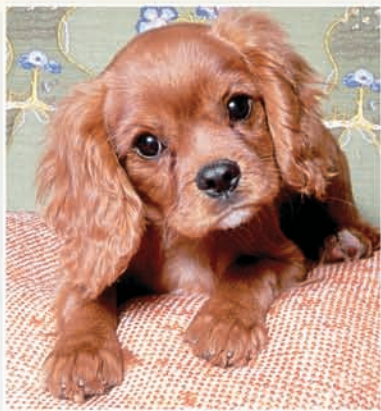
Cavalier King Charles Spaniel

The AKC recognizes more than 150 breeds of purebred dogs. Purebreds are the result of carefully selected, researched and documented breedings. Some breeds originated relatively recently, while others have existed since civilization began.