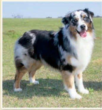
Australian Shepherd