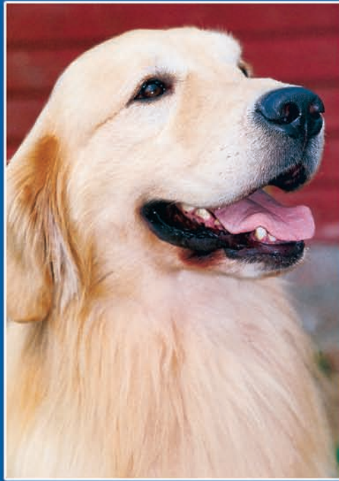
Golden Retriever

You may want a dog for many different reasons. Perhaps you're looking for a jogging companion. Maybe you'd like a therapy dog to join you in visits to hospitals and nursing homes. You may want to participate in the AKC dog show world or enjoy the challenges of other AKC events such as Obedience or Agility. Whatever the reason, your decision to bring a dog into your life is an important