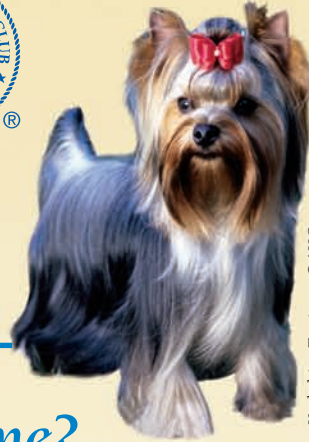
Yorkshire Terrier