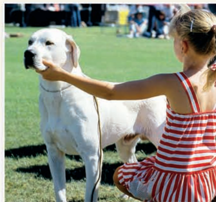
Labrador Retriever AKC Photo Files

No cause is more highly regarded by the American Kennel Club® than maintaining the heritage and future of purebred dogs. The AKC is the only dog registry that automatically incorporates health screening results into its permanent dog records. Dogs certified to be free of hip or elbow dysplasia through the Orthopedic Foundation for Animals (OFA) and dogs certified to be free of eye disease through the Canine Eye Registration Foundation (CERF) have their clearance numbers printed on AKC-certified pedigrees and registration documents. The AKC tracks more than 350,000 DNA profiles in the AKC database. Every dog owner should know their pet's history. The AKC ensures that history stays with us for future generations.