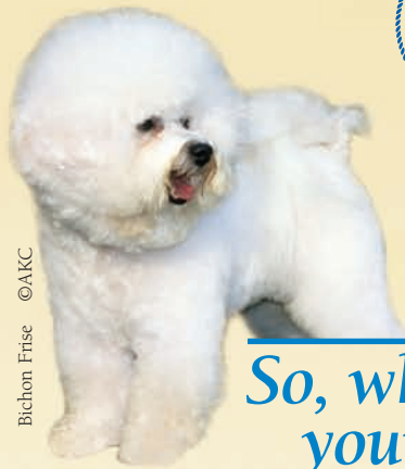
Bichon Frise